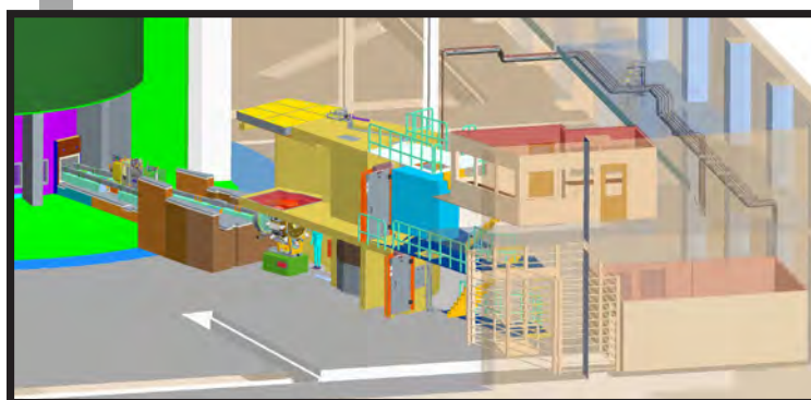
Engineering model of VISION, including T_0 chopper, bandwidth chopper, secondary spectrometer, and utility rooms.

with double-focusing crystal arrays, that focus the desired neutrons on a small detector. This arrangement leads to improved signal noise, and the overall count rate in the inelastic signal is at least two orders of magnitude beyond that of similar spectrometers that are currently available.